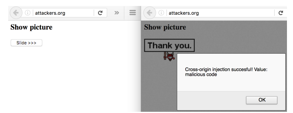
Fig. 2: Attacker defined content can be cross-origin injected.